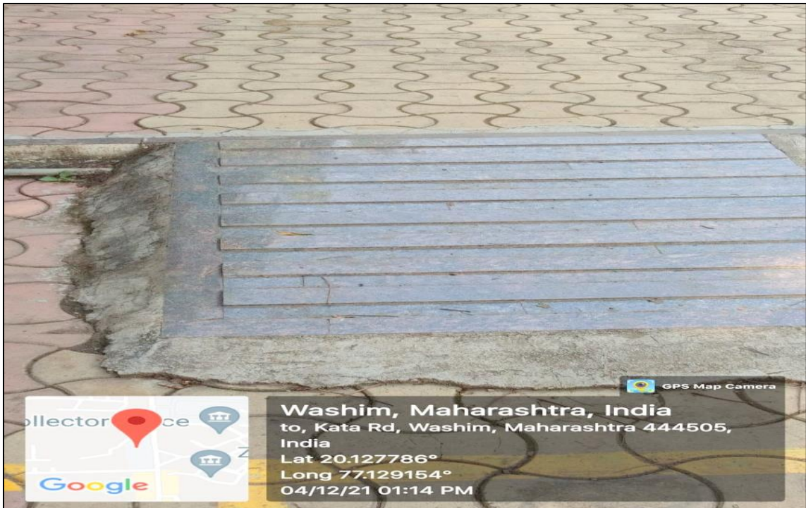
Ramps for Divyangjan