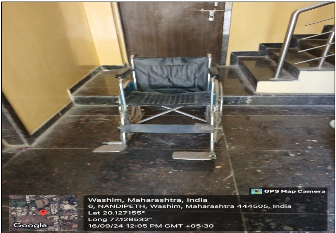
Wheel chair facility