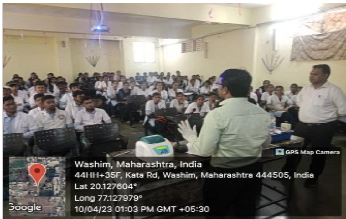
Demonstration of Molecular Techniques