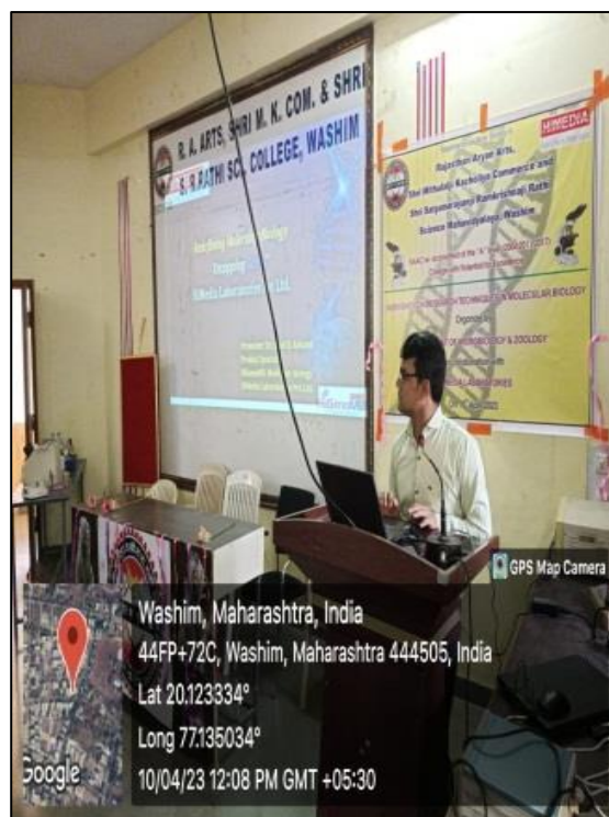
Lecture session on molecular techniques