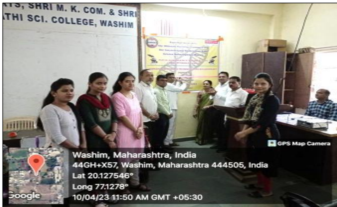
Inauguration of workshop